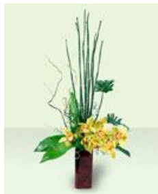
Grower Flowers Direct!